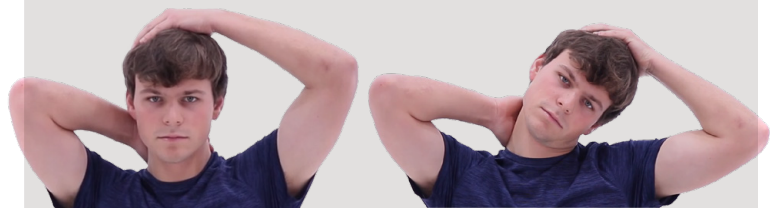
Always consult your physical therapist or physician before starting exercises you are unsure of doing.

Start by sitting upright in a chair with your low back supported. Tuck in the chin to straighten the neck. Place your right hand over the top of your head, with fingers pointed towards the ear. Keep your left hand on the back of the neck as support. Bend your neck to the right, allowing your right hand to assist you going deeper into the motion. Hold for 3 seconds.